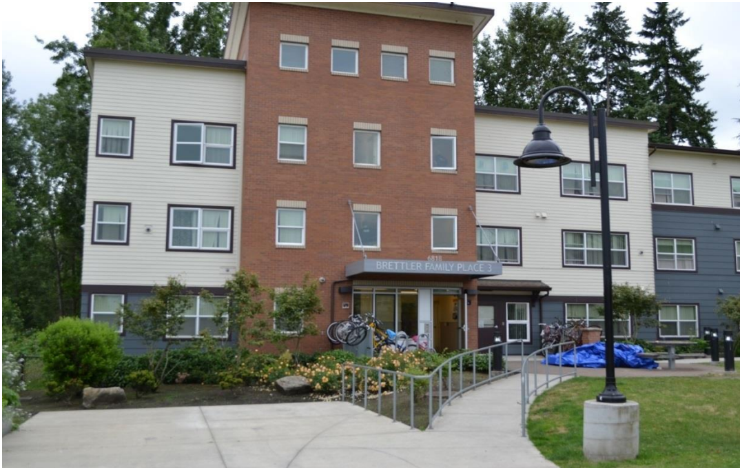
Photo is facing south toward the front of the apartment building